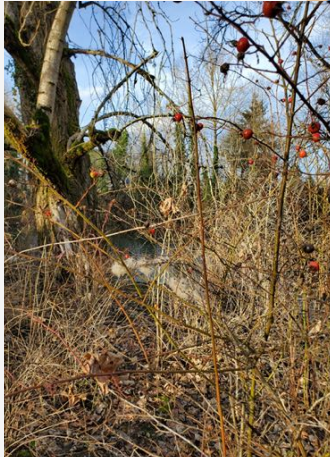
Hawthorn January 2021