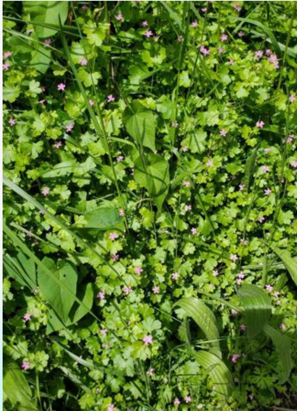
Shining Geranium May 2020