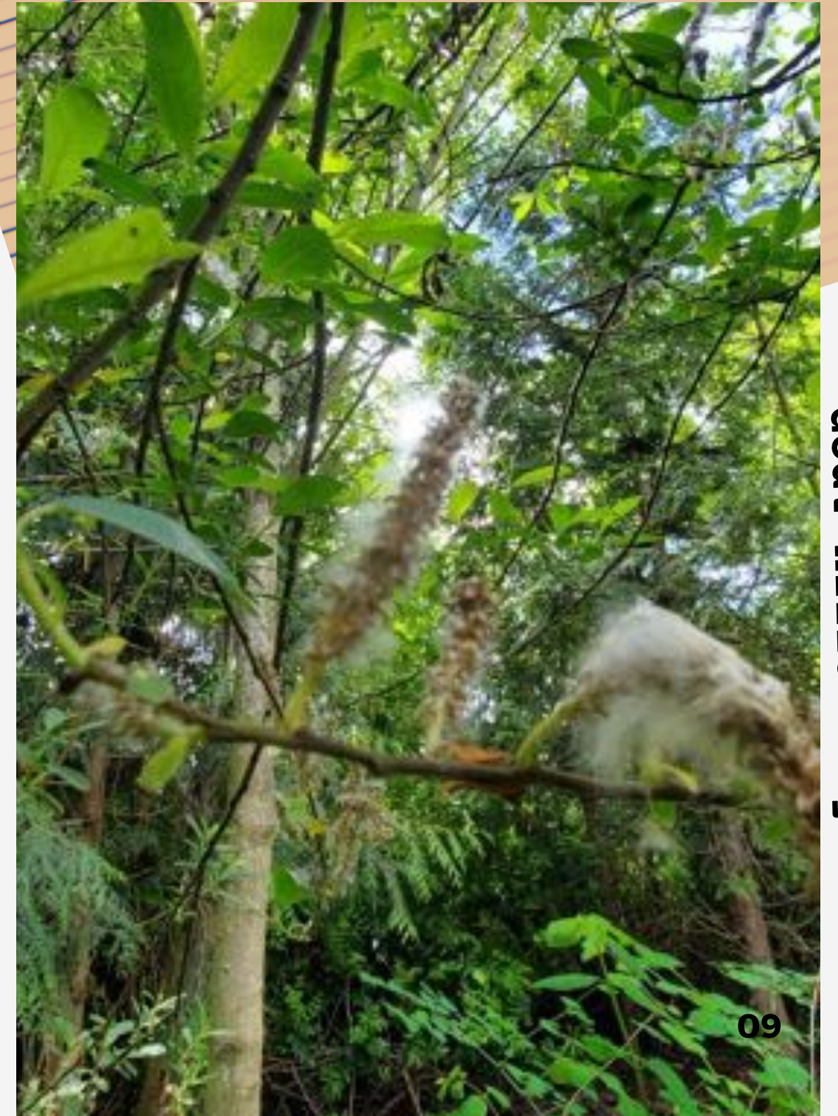
Goat Willow May 2020